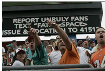
Enlarge